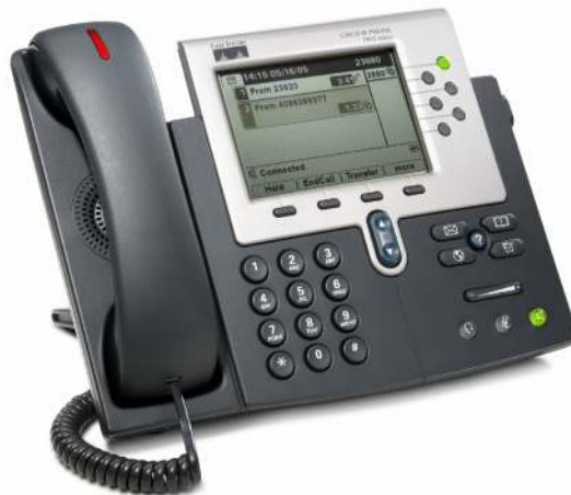
Figure 1. Cisco Unified IP Phone 7961G-GE

Providing unconstrained bandwidth to desktop applications, the Cisco Unified IP Phone 7961G-GE delivers the latest technology and advancements in Gigabit Ethernet voice-over-IP (VoIP) telephony, bringing network data and applications to users quickly with its Gigabit Ethernet port for integration with a PC or desktop server (Figure 1). “Feature identical” to the Cisco Unified IP Phone 7961G, this Gigabit Ethernet enhanced manager IP phone provides six programmable backlit line/feature buttons and four interactive soft keys that guide an executive or manager-type user through call features and functions, and audio controls for high-quality duplex speakerphone, handset, and headset. The Cisco Unified IP Phone 7961G-GE features a best-of-class large, higher-resolution, grayscale pixel-based LCD for easy access to communication information, timesaving applications, and feature usage (Figure 2). It also helps customers and developers deliver more innovative and productivity-enhancing Extensible Markup Language (XML) applications and can provide double-byte languages to the display.