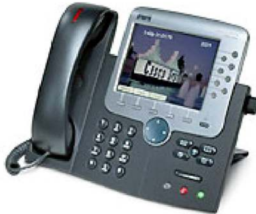
Figure 1. Cisco Unified IP Phone 7971G-GE

The Cisco Unified Communications system of voice and IP Communications products and applications helps organizations communicate more effectively—by helping them streamline business processes, reach the right resource the first time, and enhance productivity. The Cisco Unified Communications portfolio is an integral part of the Cisco Business Communications Solution—an integrated solution for organizations of all sizes that also includes network infrastructure, security, and network management products; wireless connectivity; and a lifecycle services approach, along with flexible deployment and outsourced management options, end-user and partner financing packages, and third-party communications applications.