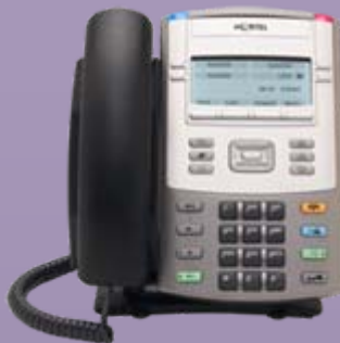
IP Phone 1120E