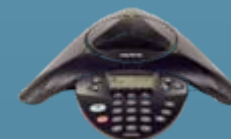
2033 IP Audio Conference Phone