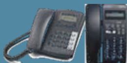
3rd party H.323 / SIP IP Phones Regionally offered