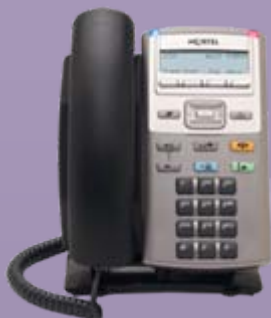
IP Phone 1110