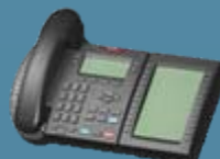
IP KEM (Key Expansion Module)