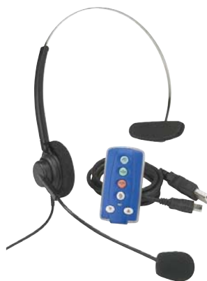
Nortel Mobile USB Headset Adapter and Headset

Cost-effective — With the IP Softphone 2050 for Windows PC, in addition to the bandwidth savings associated with IP Telephone networks and reduced costs of infrastructure, companies can extend the reach of their network, thereby offering savings on mobile phone charges they pay today.